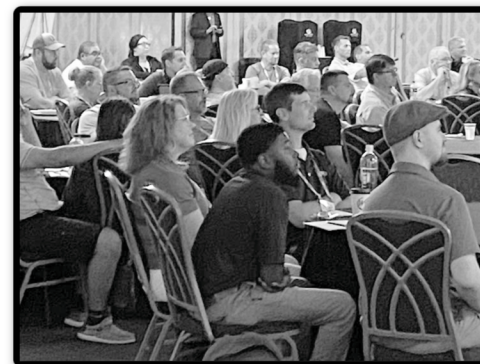
Get your brand in front of the decision makers you want to meet!