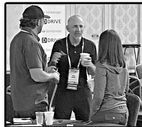
Network with business owners at DRIVE EXPO!

The A/V Media sponsorship option at DRIVE EXPO offers sponsors the chance to showcase their brand through 30-second video promotional spots played in workshop rooms as attendees settle in. This high-visibility opportunity allows sponsors to impress their target audience with engaging content right before workshops begin, ensuring maximum exposure and impact. Additionally, this sponsorship package includes a DRIVE Pavilion Exhibit Space at ShopXpo during WreckWeek, providing sponsors with a physical presence to further amplify their brand and engage with attendees. With this comprehensive package, sponsors can effectively leverage multimedia content to enhance brand awareness, drive engagement and make a lasting impression on attendees at DRIVE EXPO.