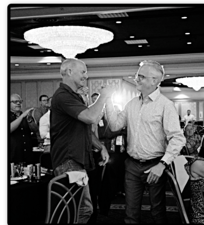
Connect and network with business owners.